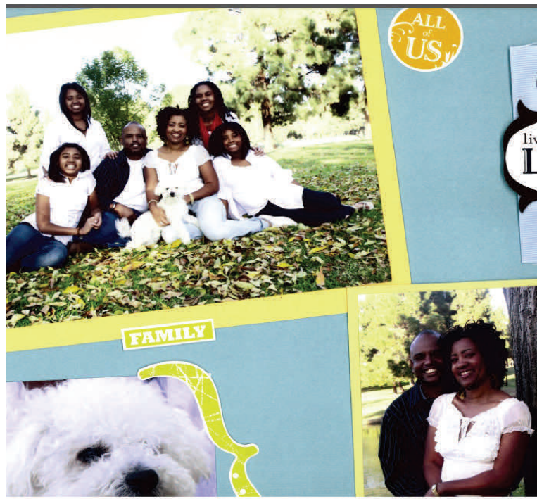
The Archer Clan

When I think about where we are now and where we were when I was in school, I have to say it's good to see that legal writing has developed so much as a discipline. It is exciting and encouraging that people