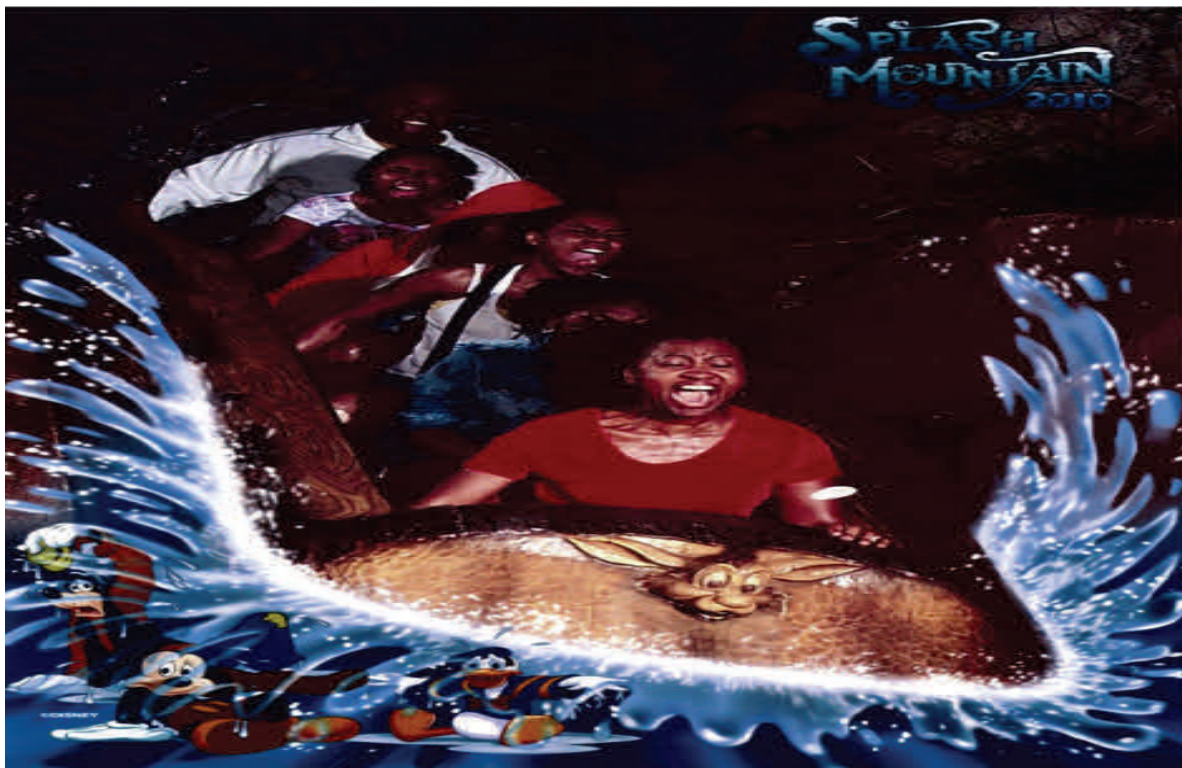
The Archers at Play