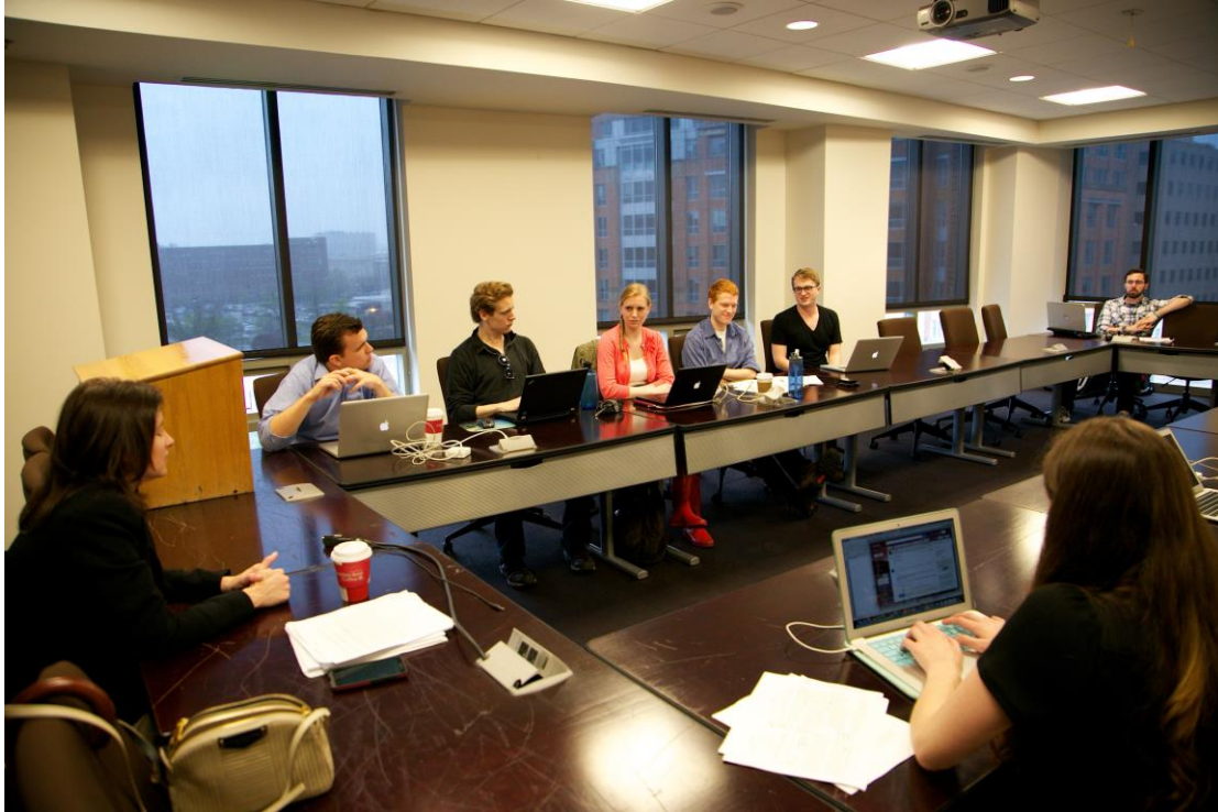
Hotung Seminar Room (seats 24)

(c) Auditorium (plenary session) space for 450-500 people? (Note: Conference attendance varies from biennial to biennial. In 2016, there were roughly 500 attendees.)