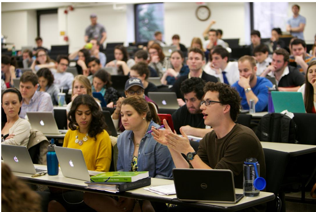
McDonough Classroom (seats 150)